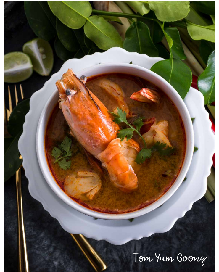
Tom Yam Goong

Thin sliced beef tenderloin, rocket salad, parmesan and balsamic reduction with shredded marinated egg yolk