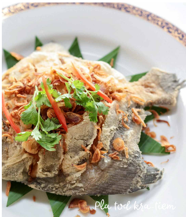
Pla tod kra-tiem