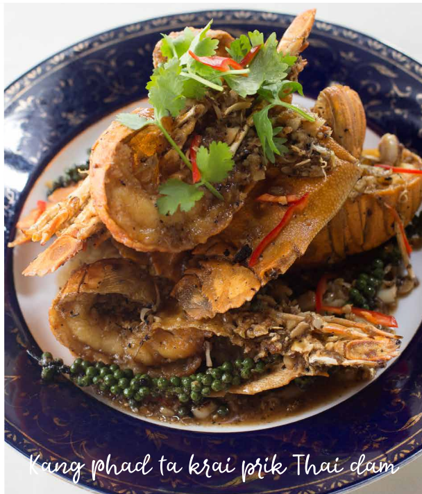
Kang phad ta krai prik Thai dam