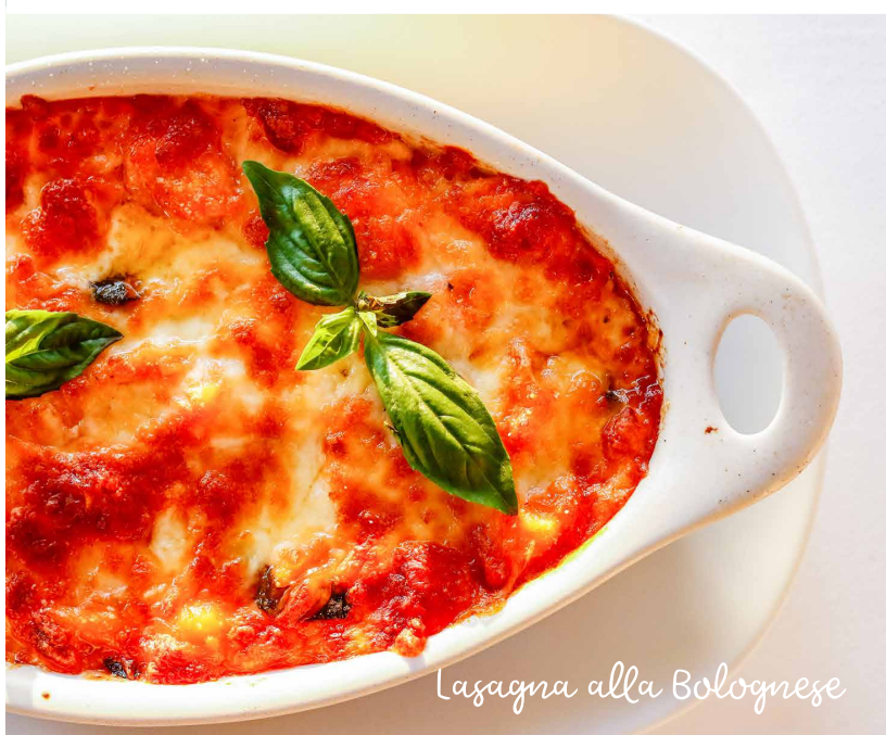
Lasagna alla Bolognese