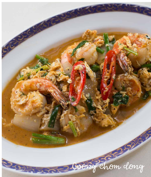
Goong chom dong